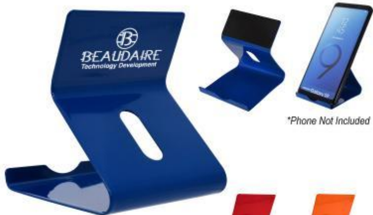
*Phone Not Included