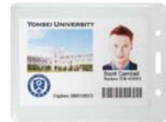
SM-2461 | Name Card Holder 3.25" W x 4.25" L US $0.12/CDN $0.17 [G]