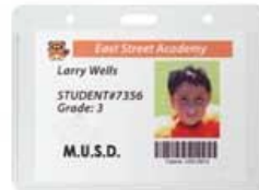
SM-2460 | ID Card Holder 4" W x 3" L US $0.12/CDN $0.17 [G]