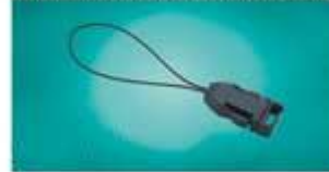
SM-8121 Metal Swivel Square Snap Hook